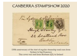
PPCs Pacific Steam Mail & Transcontinental Railway anniversaries

Special Canberra Stampshow 2020 M/S Announced in February!