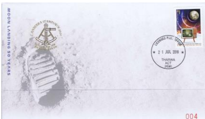
Included in Supporter's Pack

In order to maintain the integrity of your credit card details please print this form and send to: Souvenir Orders, Canberra Stampshow 2020, GPO Box 1840, CANBERRA ACT 2601 All e-mail enquiries to: Bruce Parker bruceandjudy.parker@bigpond.com